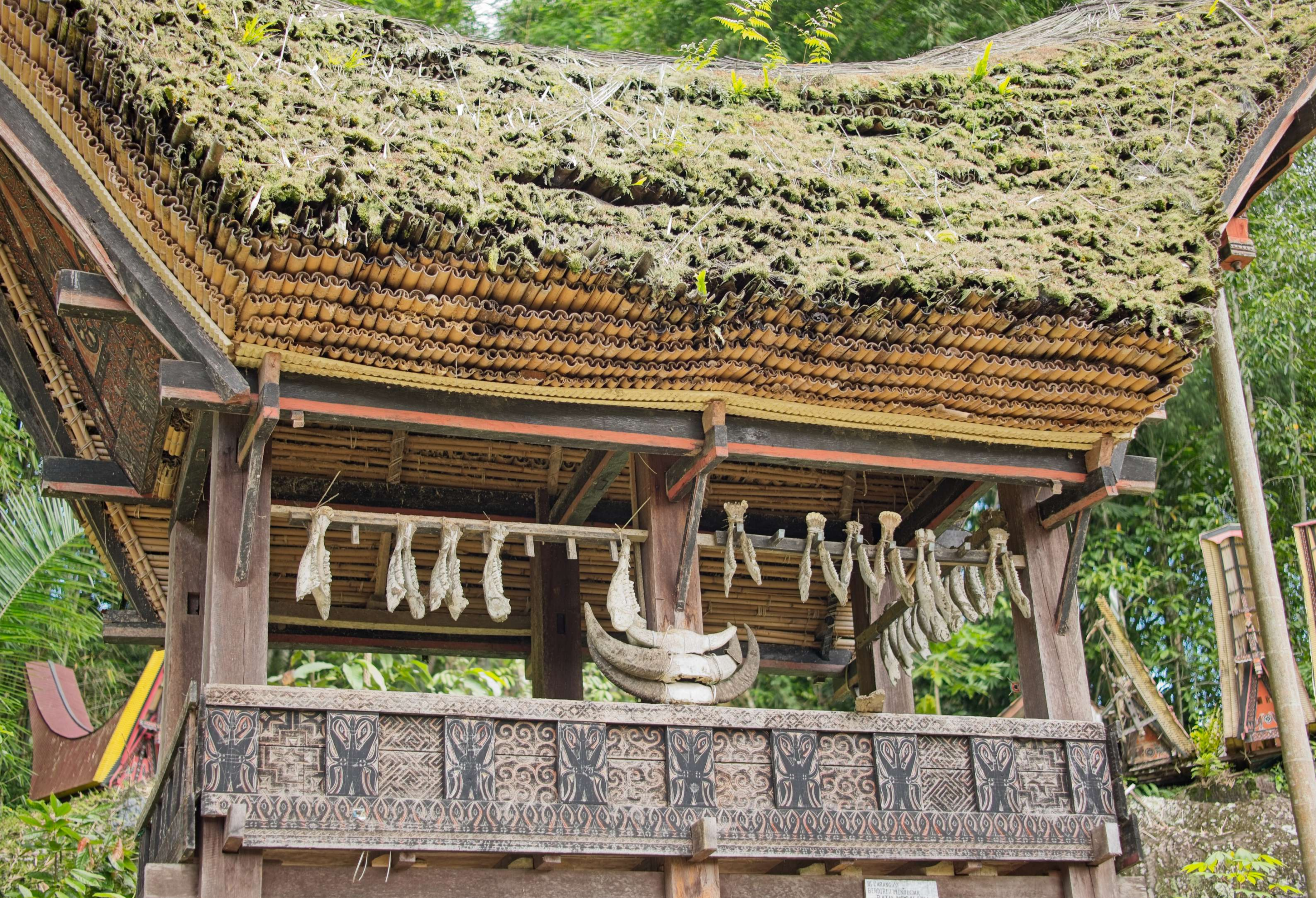
DI CARANG// BEROTI / MENDONGA BATA