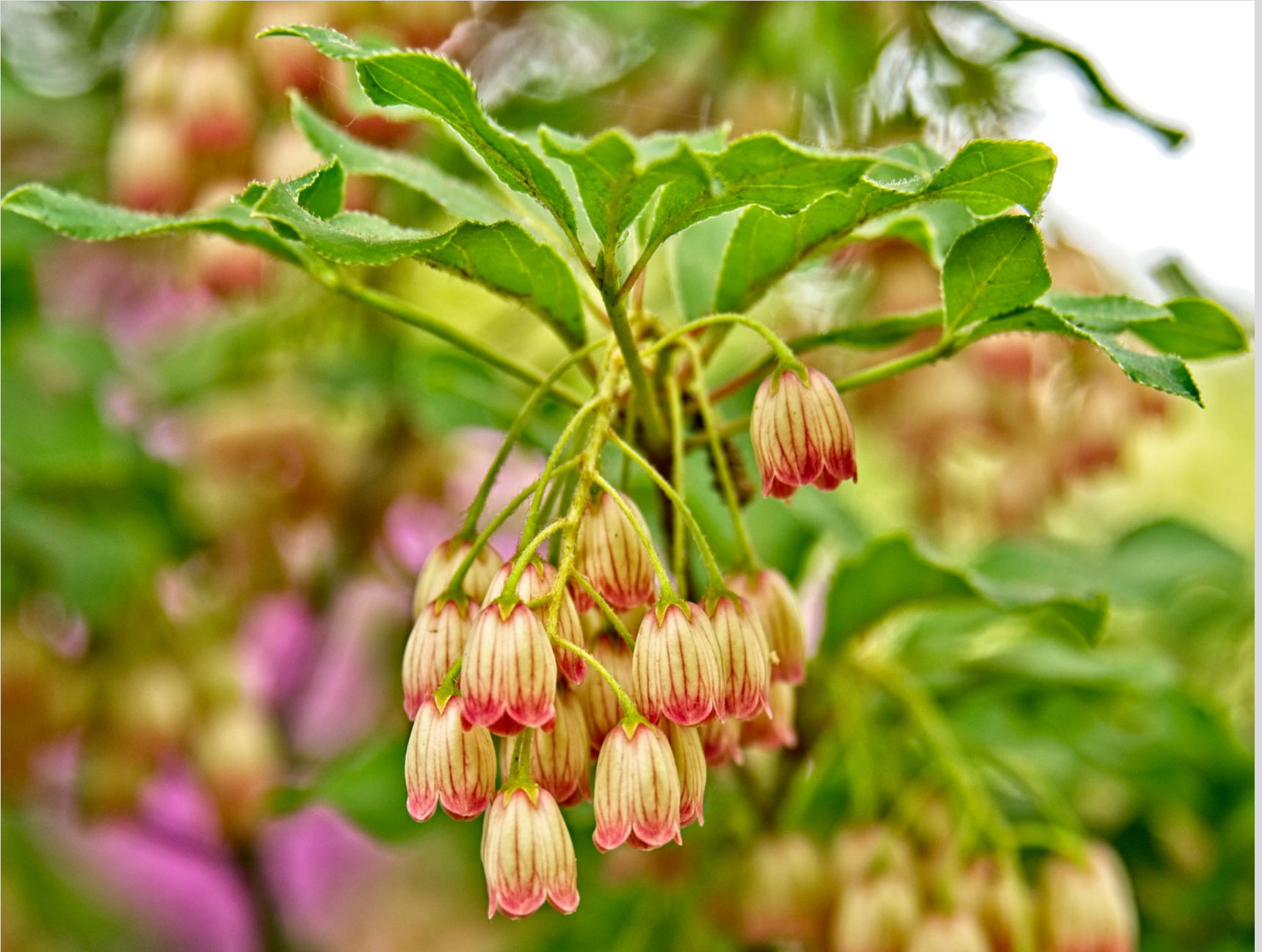
Hanging buds 1