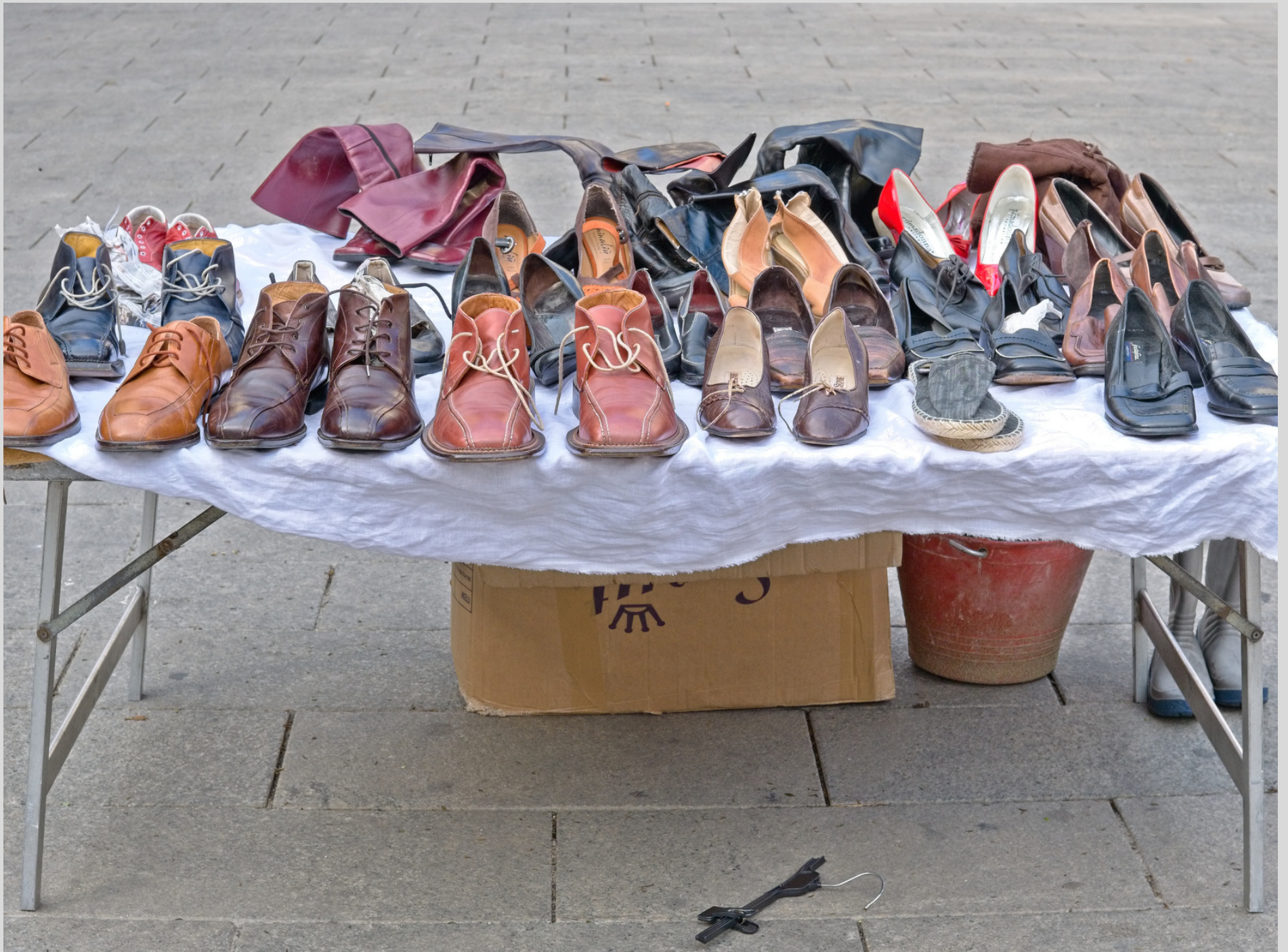
Sardinia second hand shoes