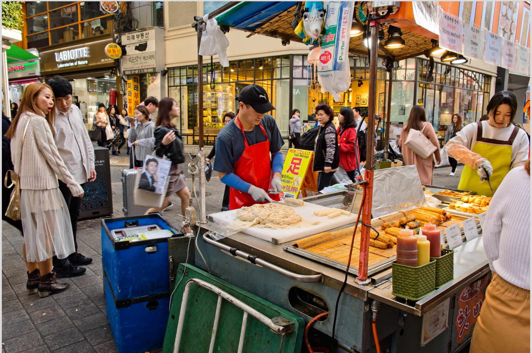
Seoul corn and noodles