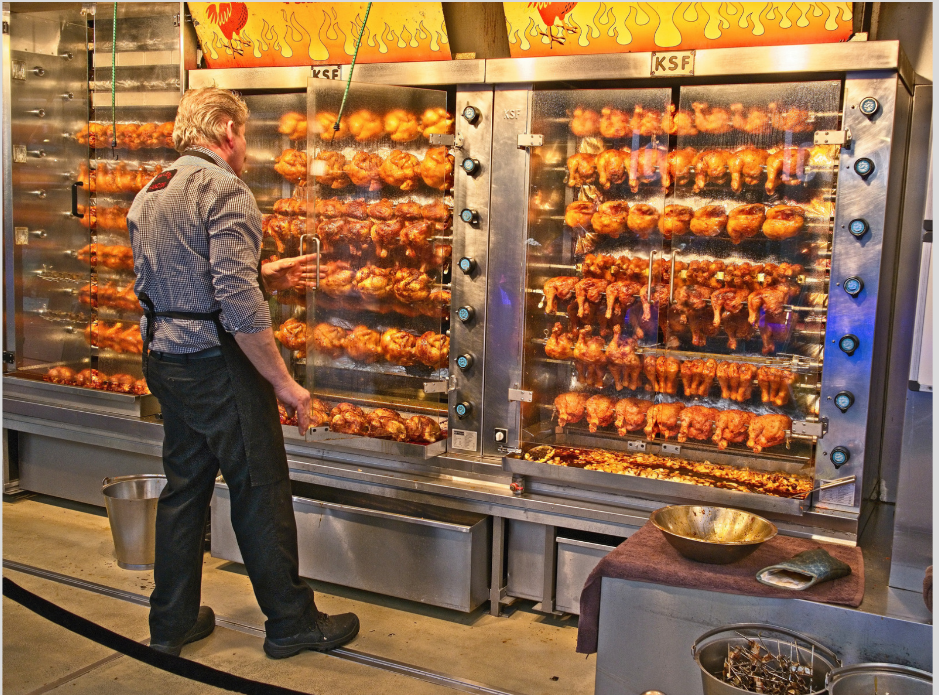
Amstelveen fried chickens