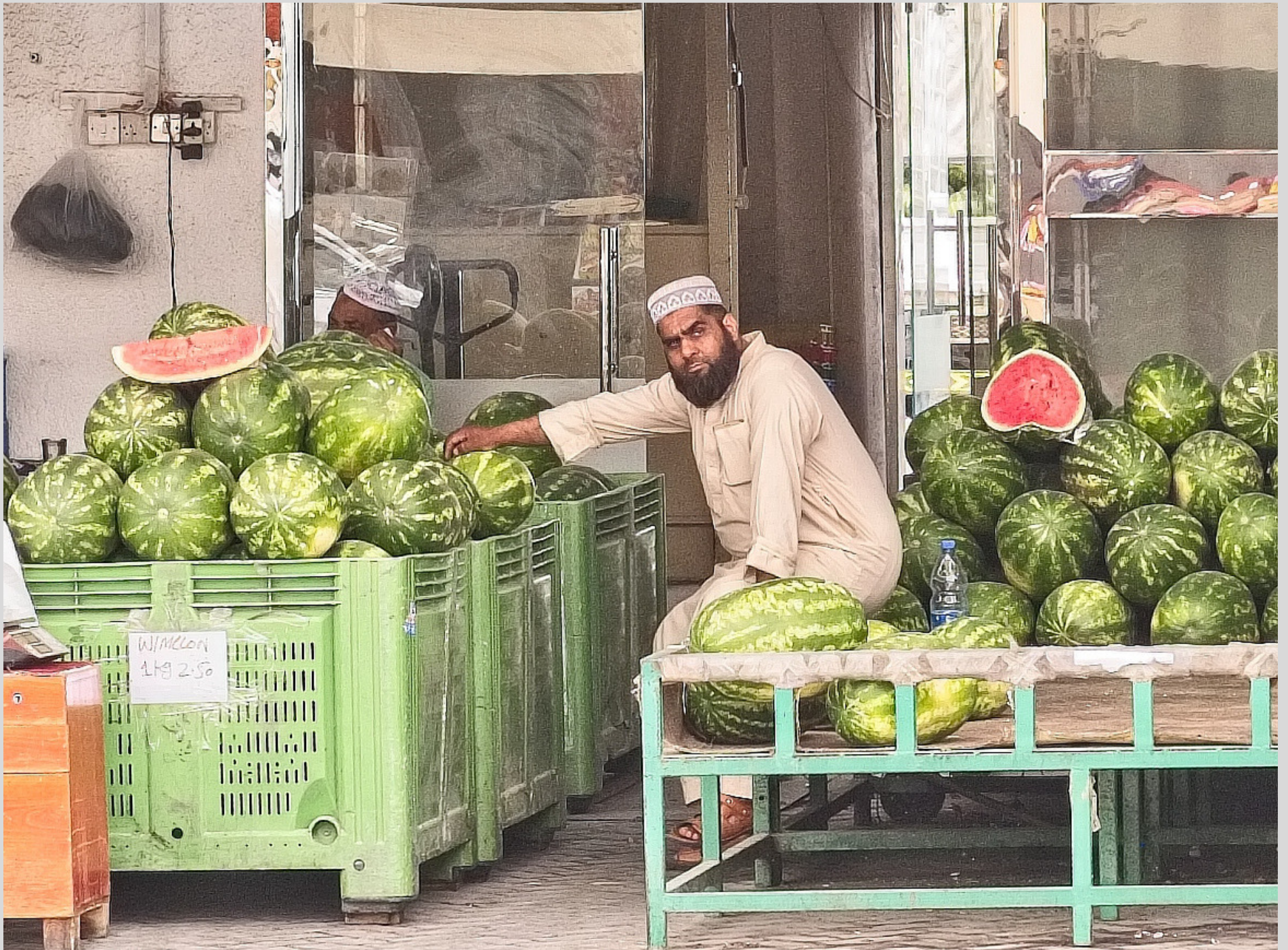
Abu Dhabi watermelon seller