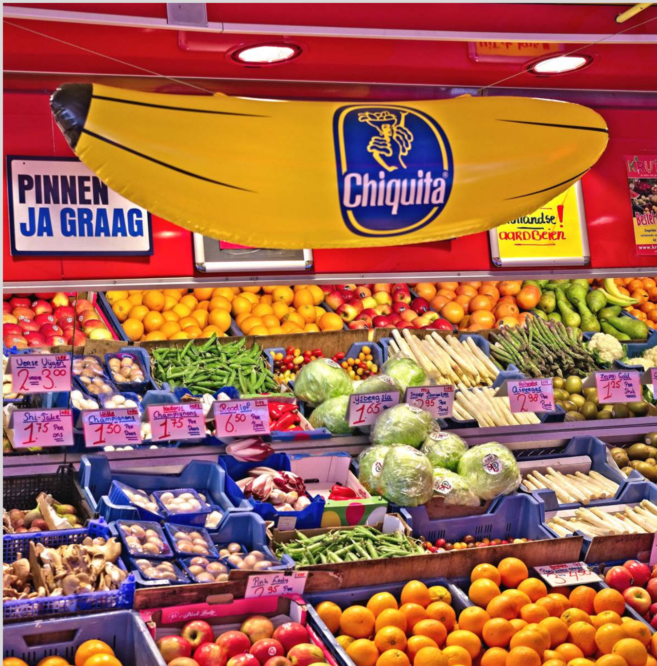
Leiden fruit and vegetable stand