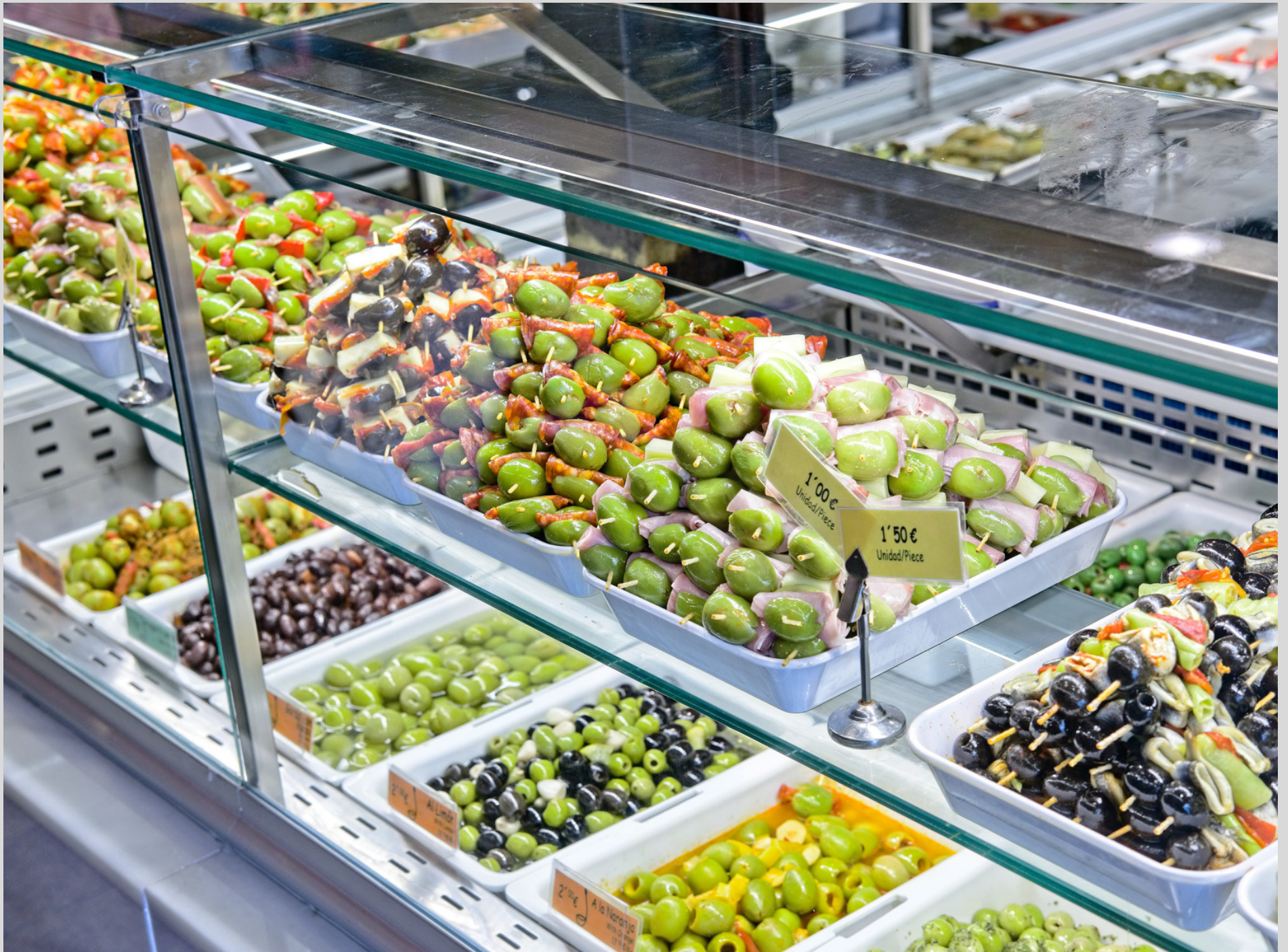
Madrid stuffed olives