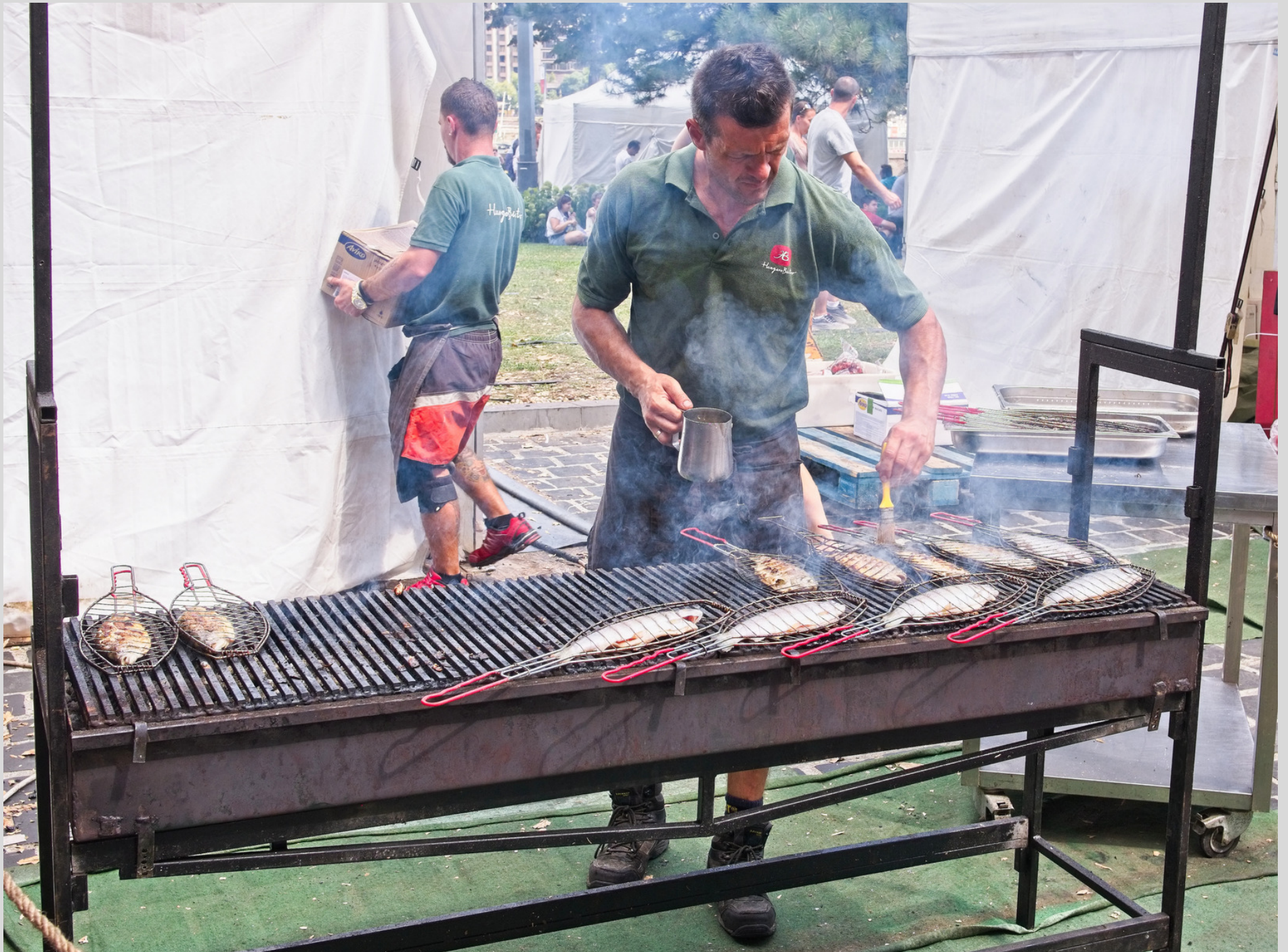
Budapest fish fry