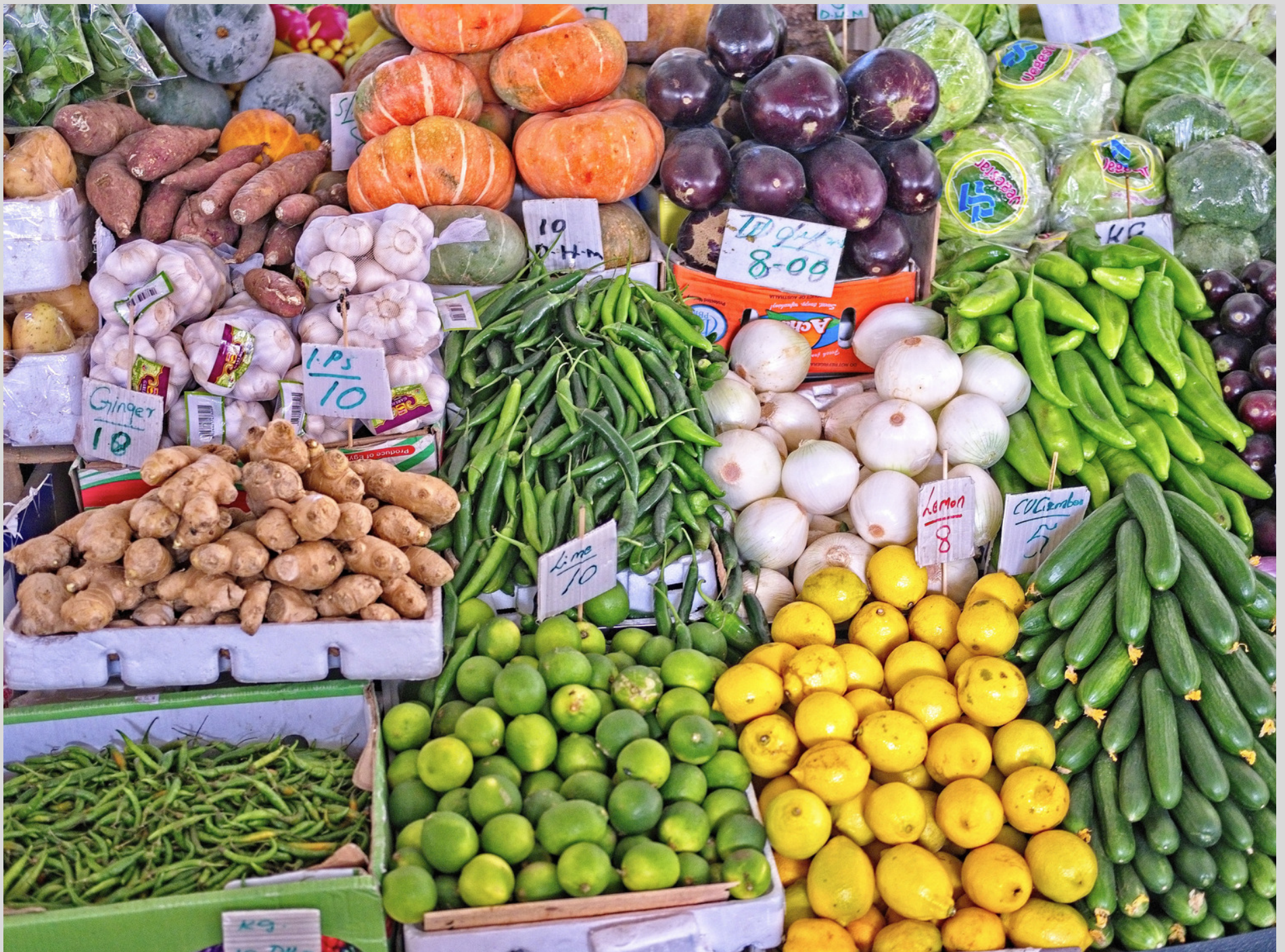
Abu Dhabi vegetables