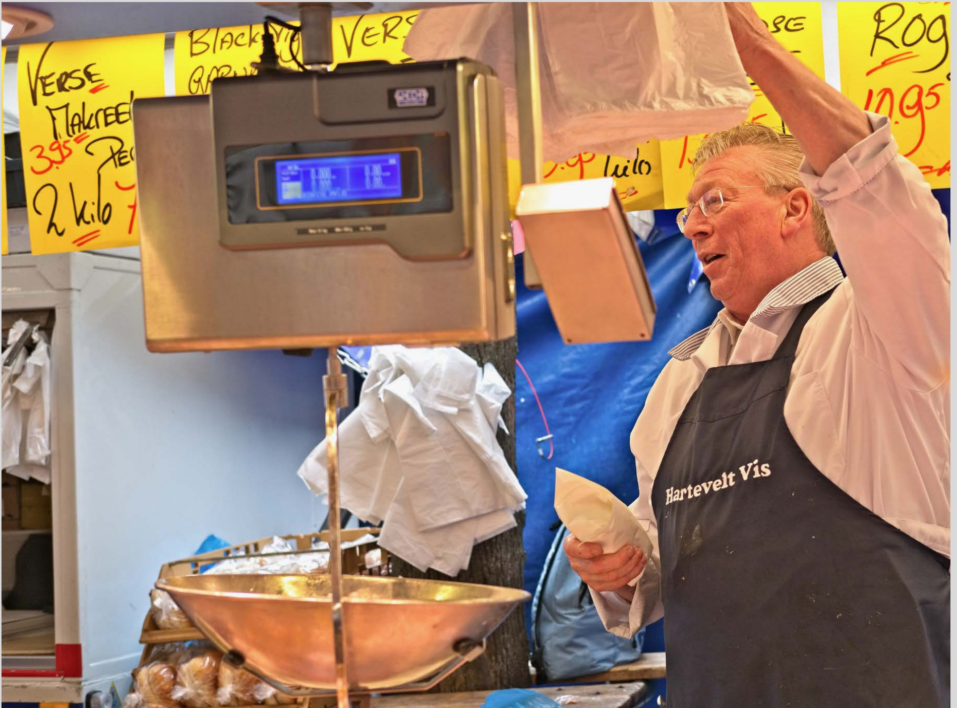
Leiden fish seller