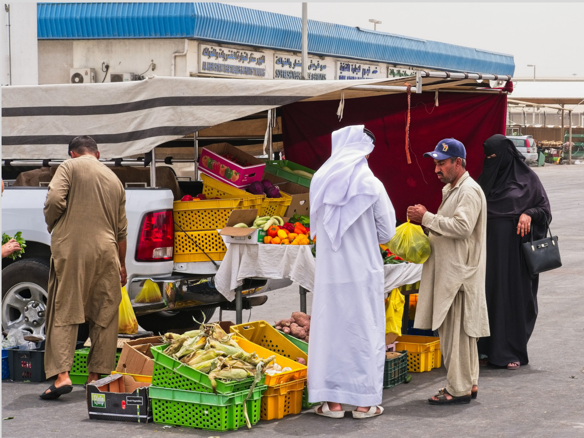
Abu Dhabi fruit and vegetable market