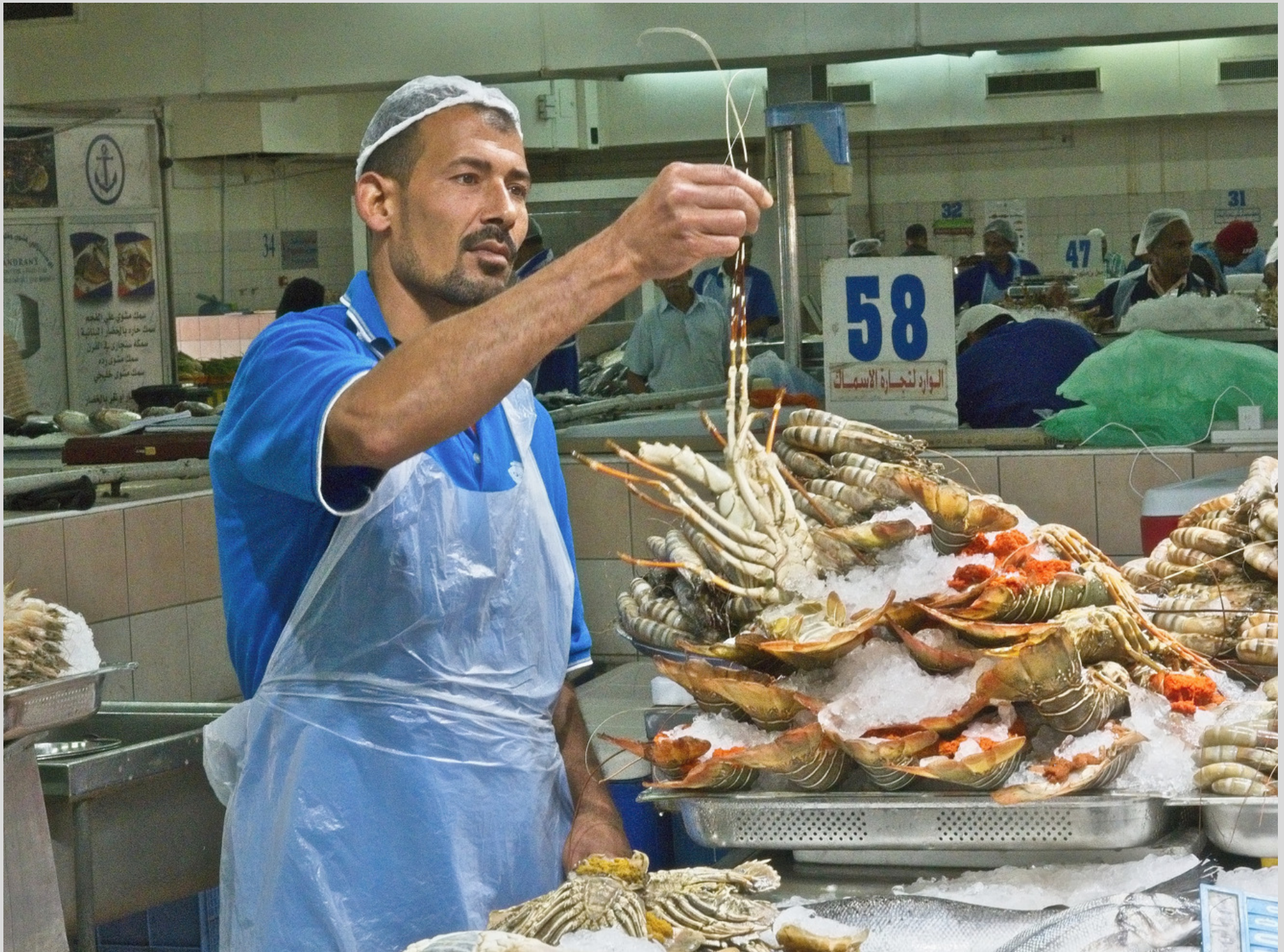
Abu Dhabi fish market