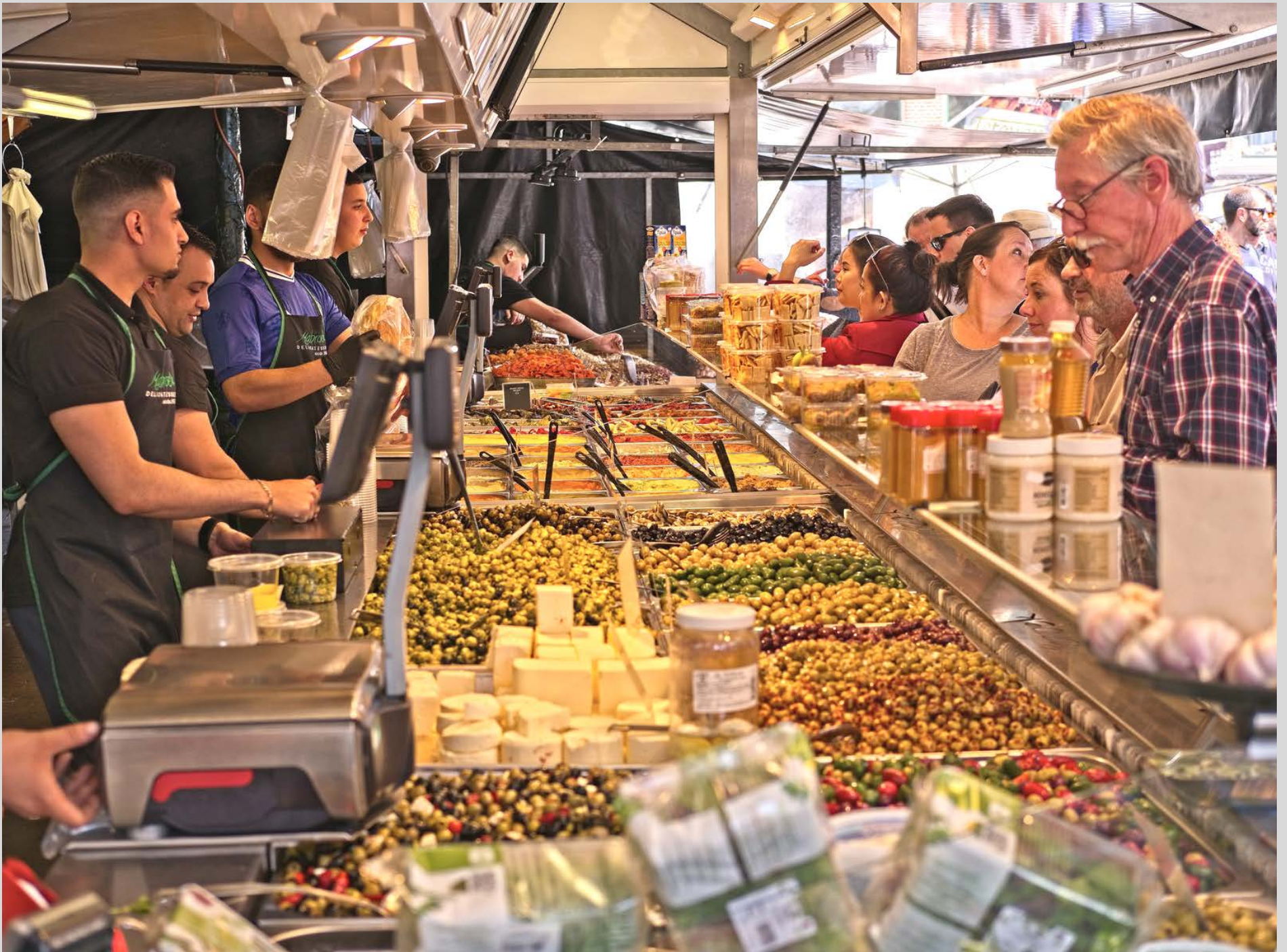
Leiden olives sellers