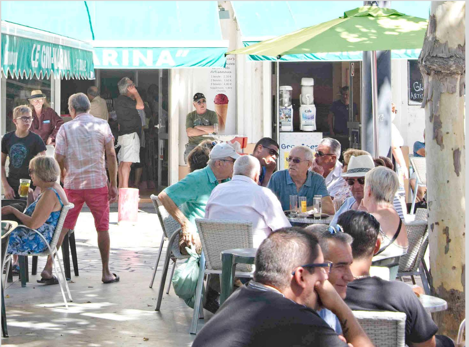
Meze market cafe