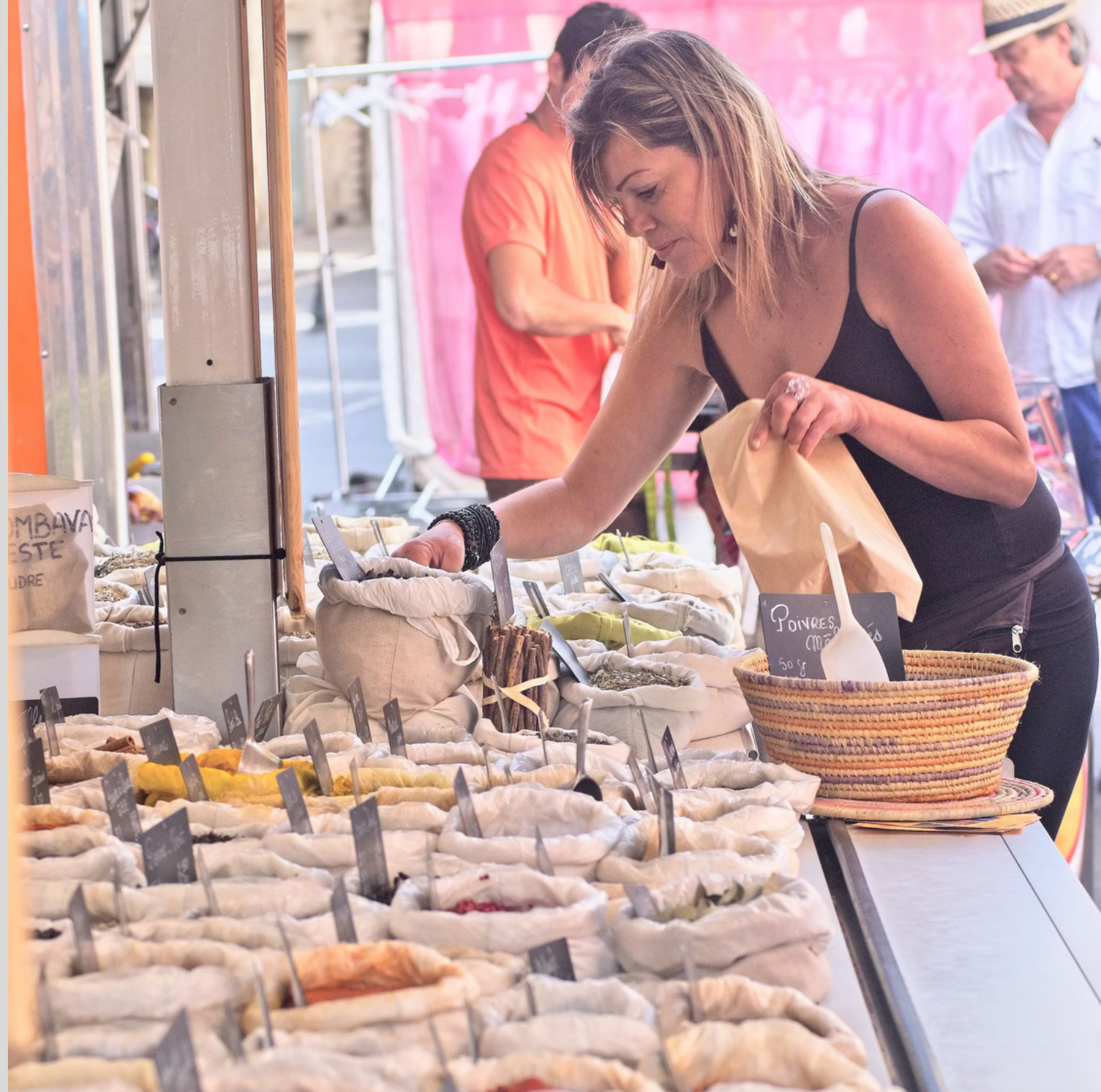
Pezenas spice seller