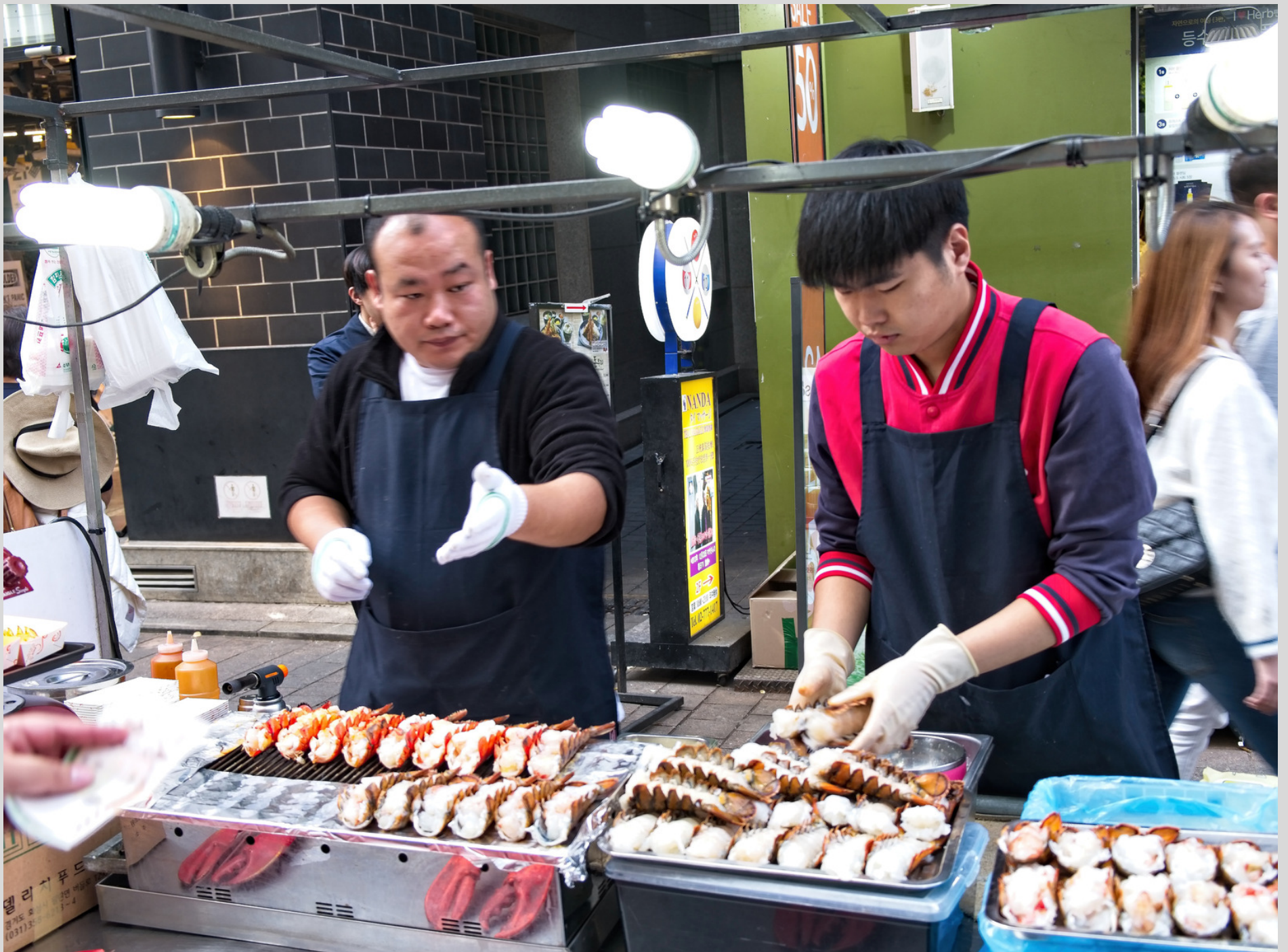
Seoul stuffed lobster