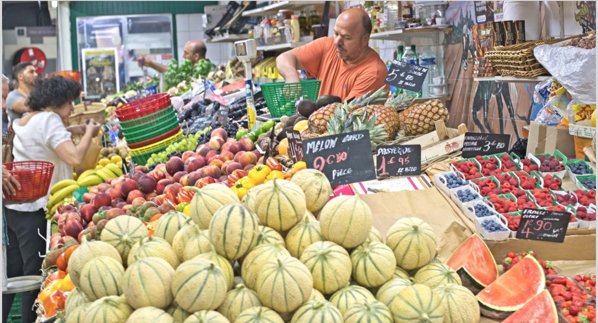
Nime fruit seller