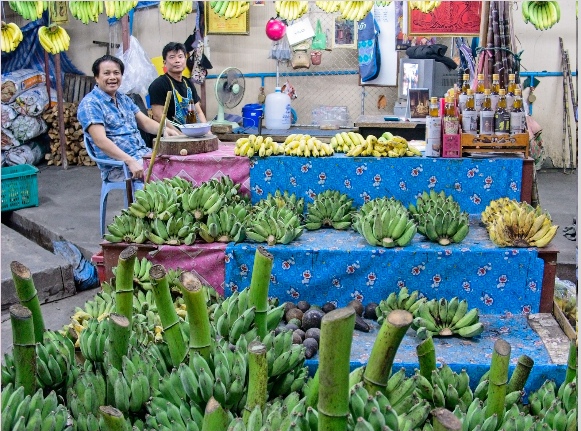
Chiang Mai banana stall