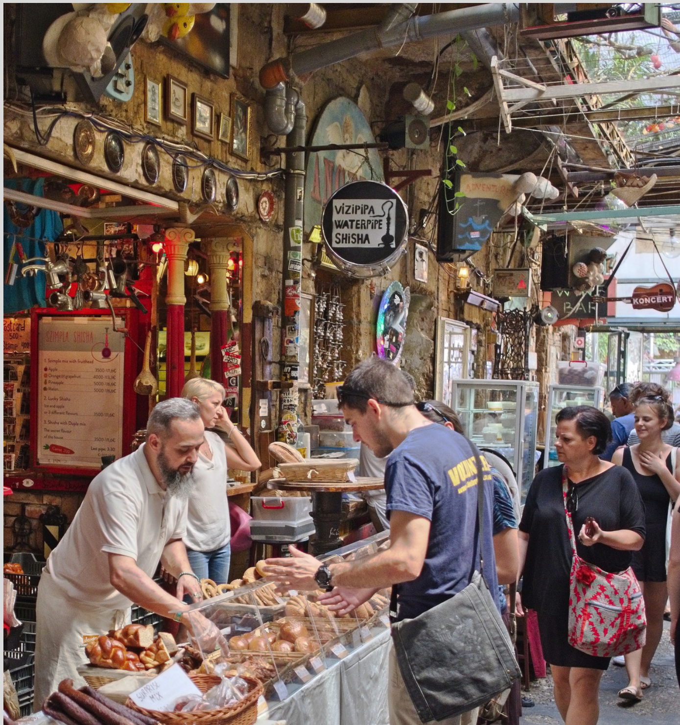
Budapest baked goods