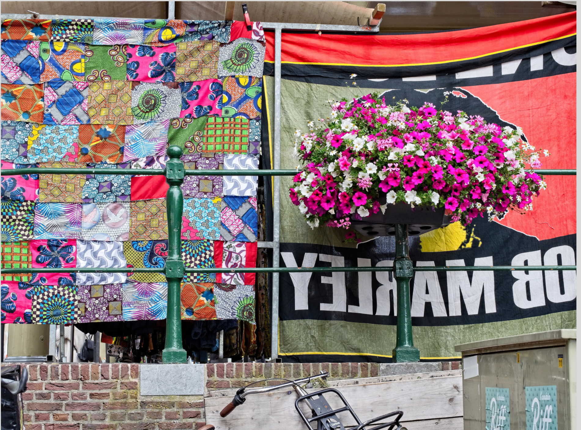
Leiden, wall hangings for sale