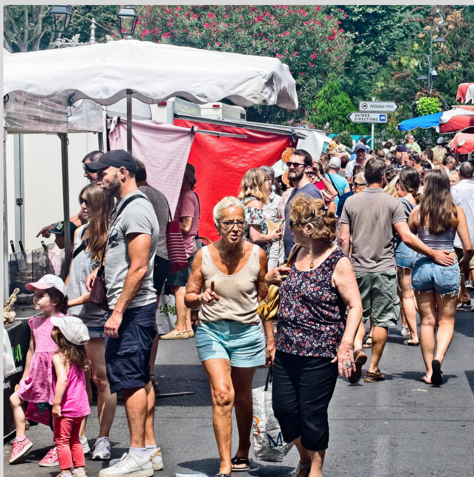
At the Pezenas market