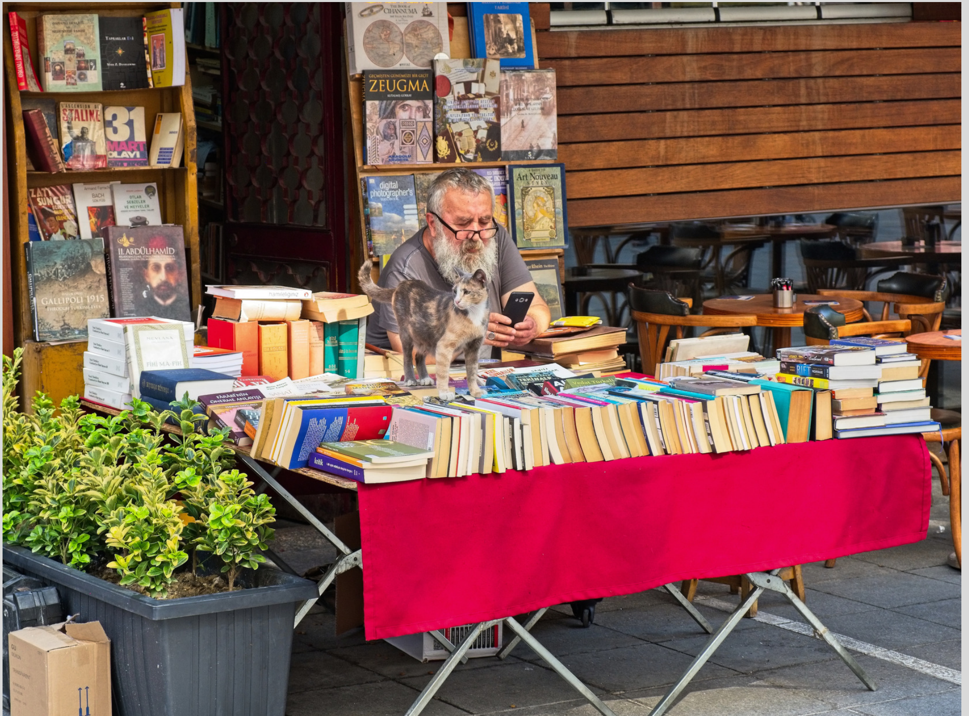
Istanbul book seller