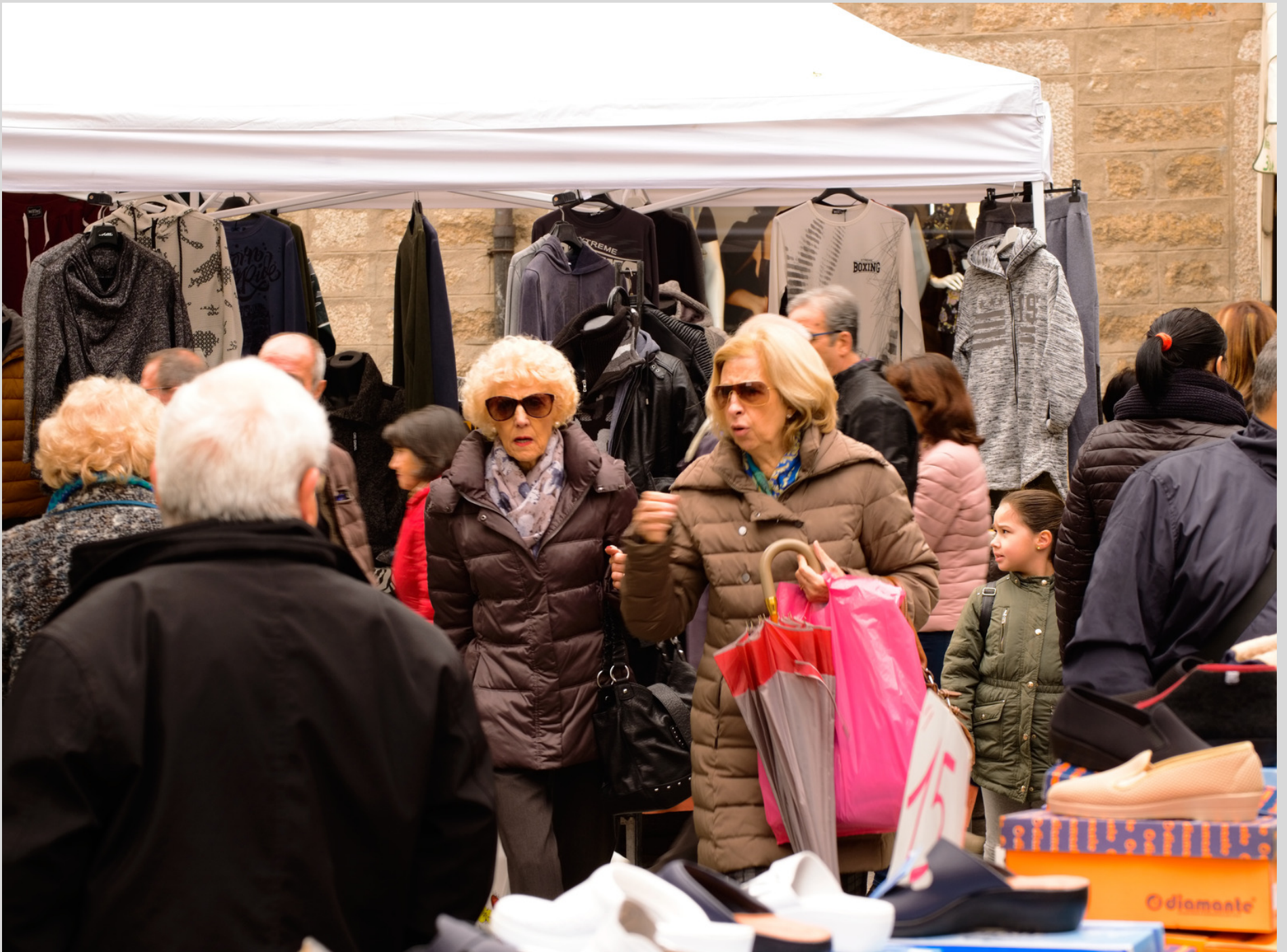
Sardinia clothing stall