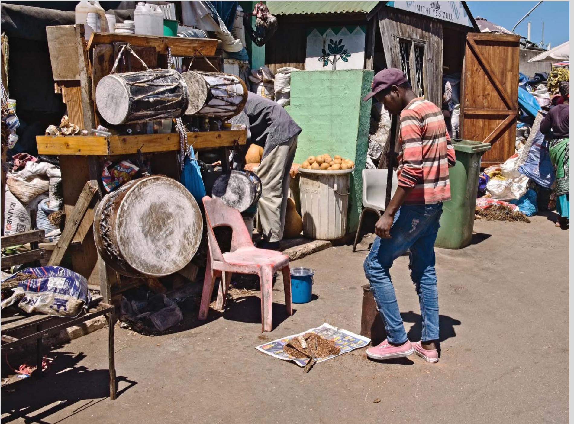
Durban city market 2