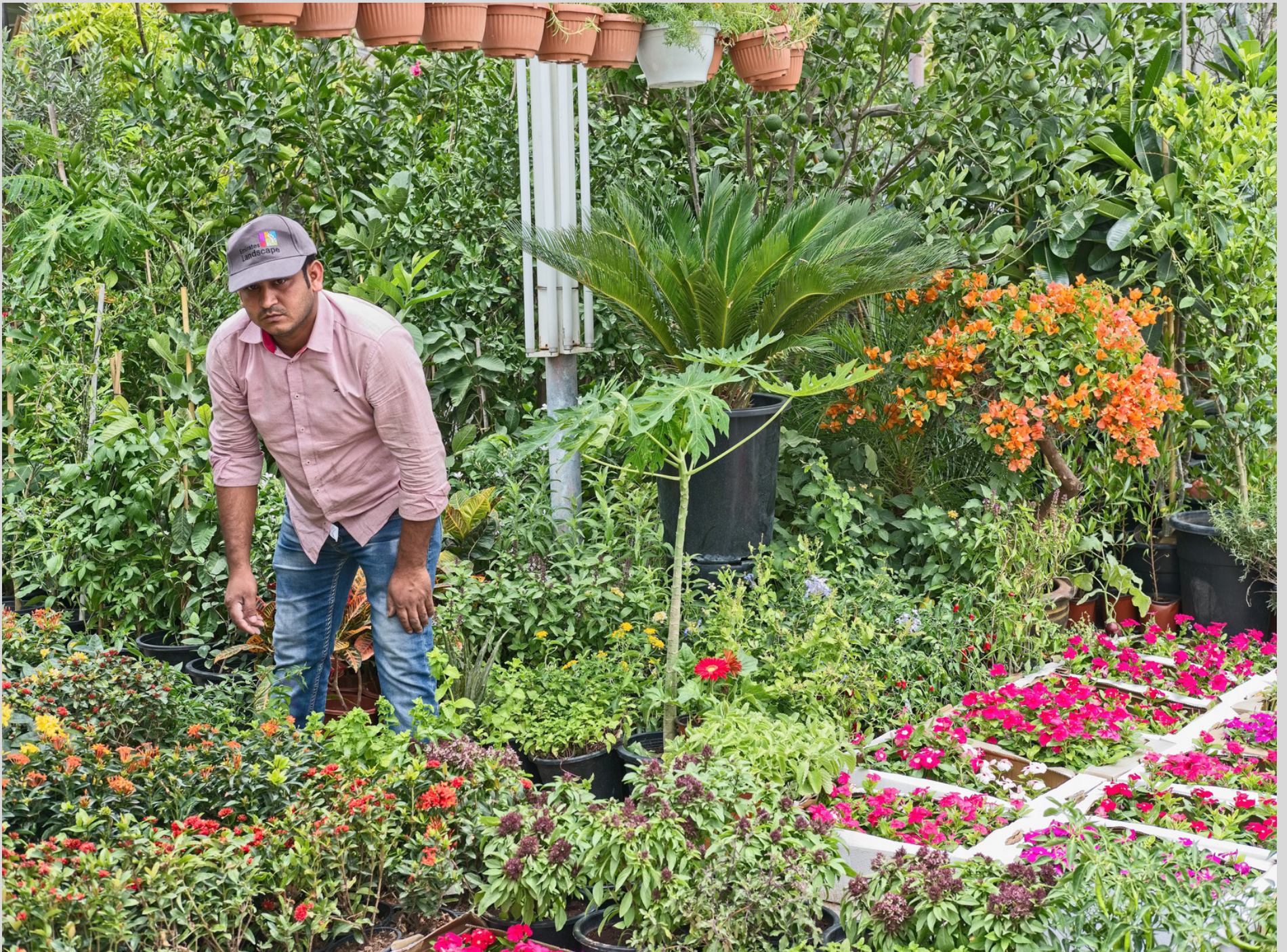
Abu Dhabi flower market