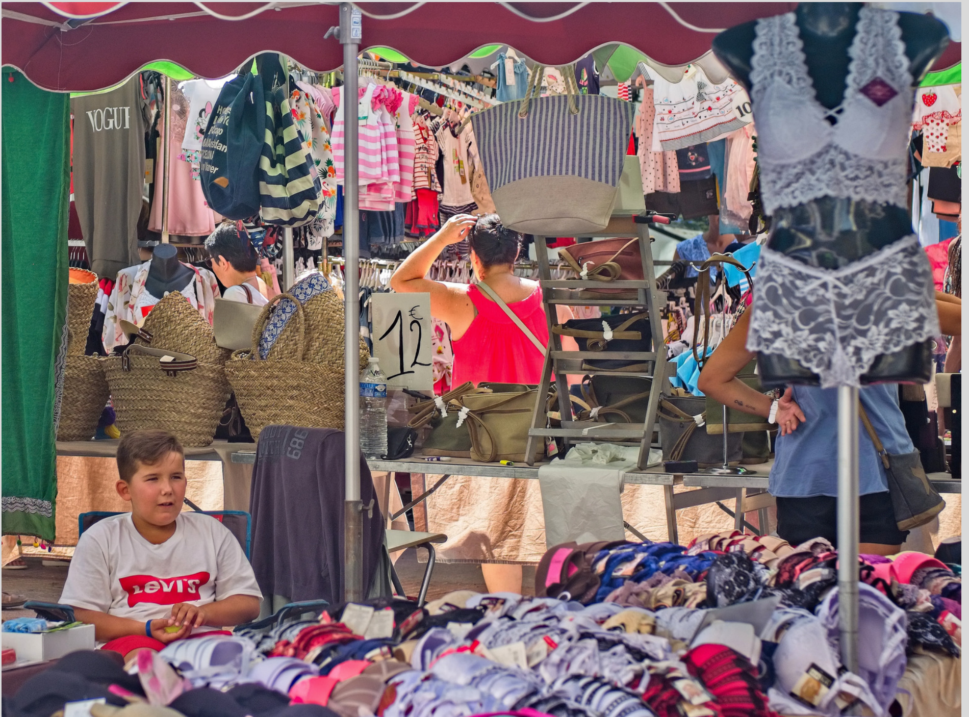
Meze Ladies Underwear