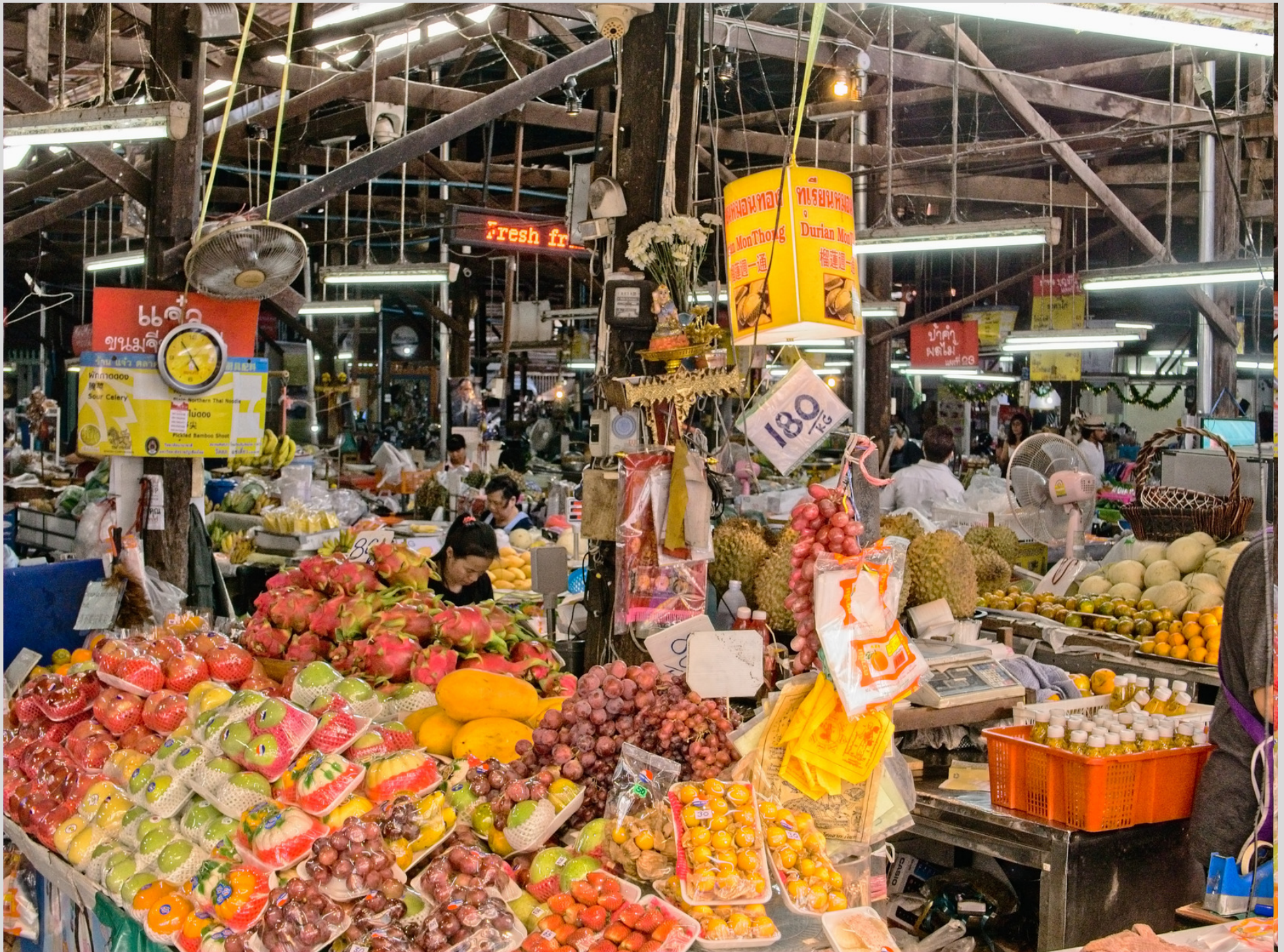
Chiang Mai fruit seller