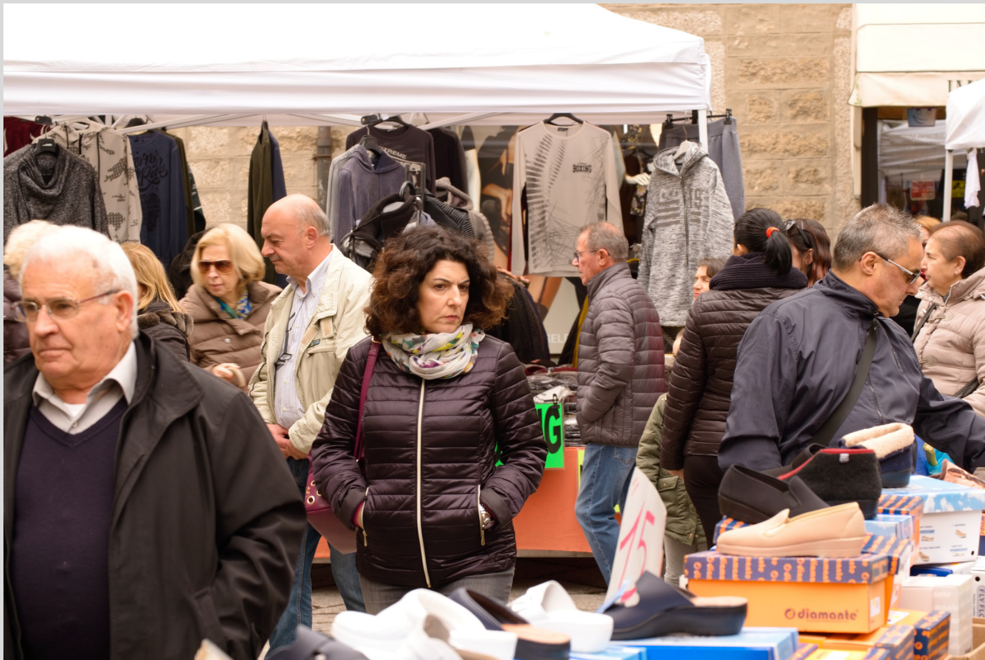
Sardinia shoe stand