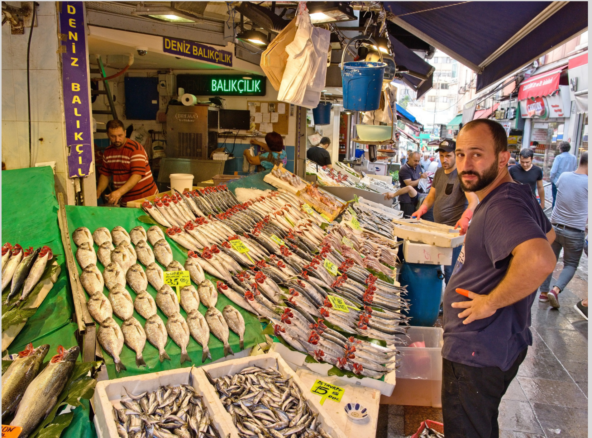
Istanbul fish seller