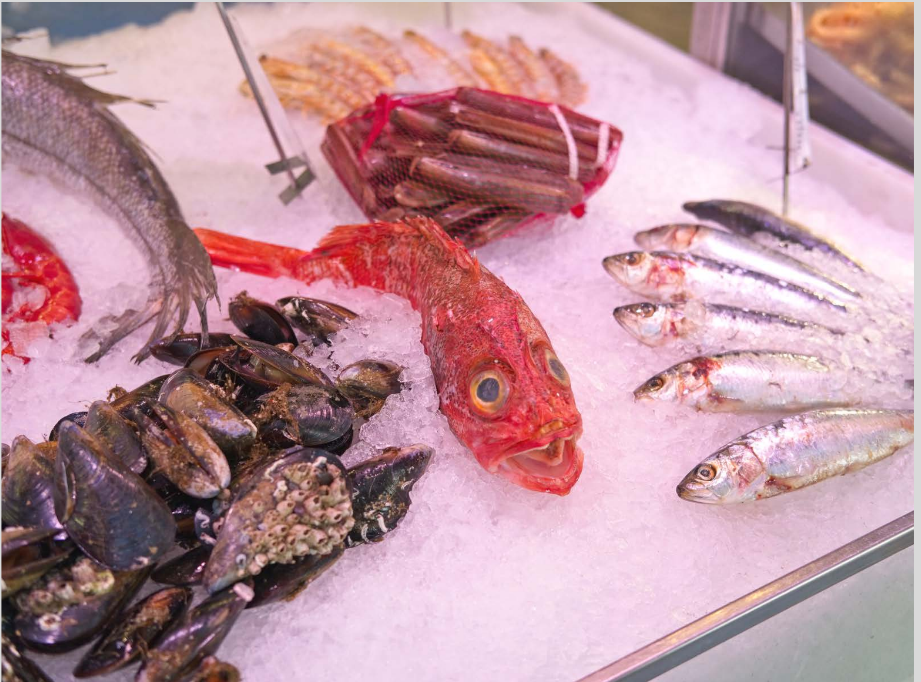
Madrid fish on ice