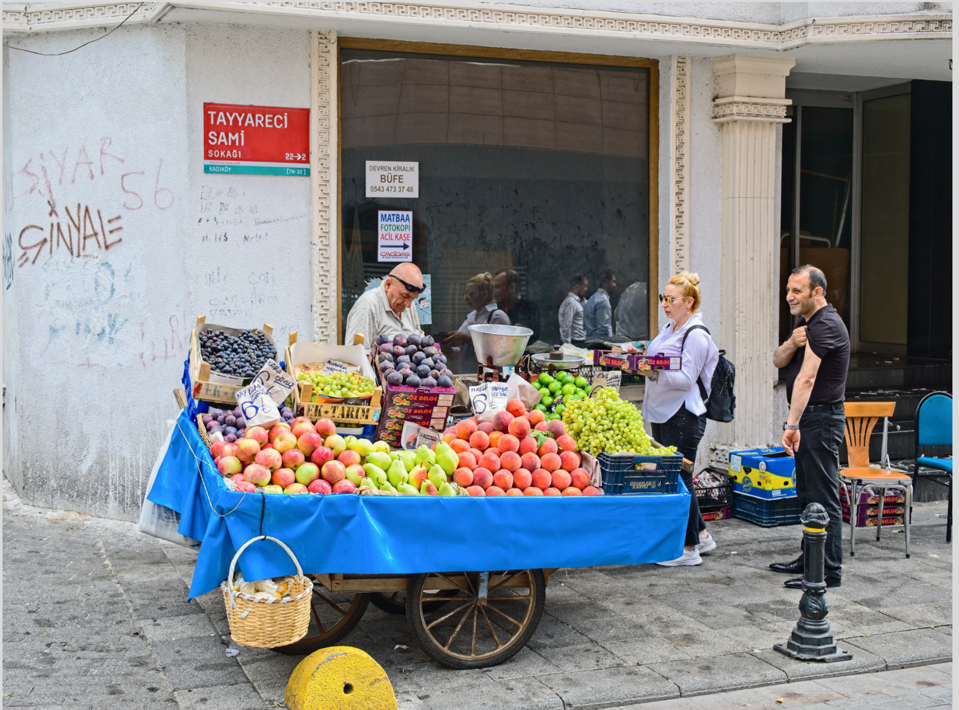
Istanbul fruit cart