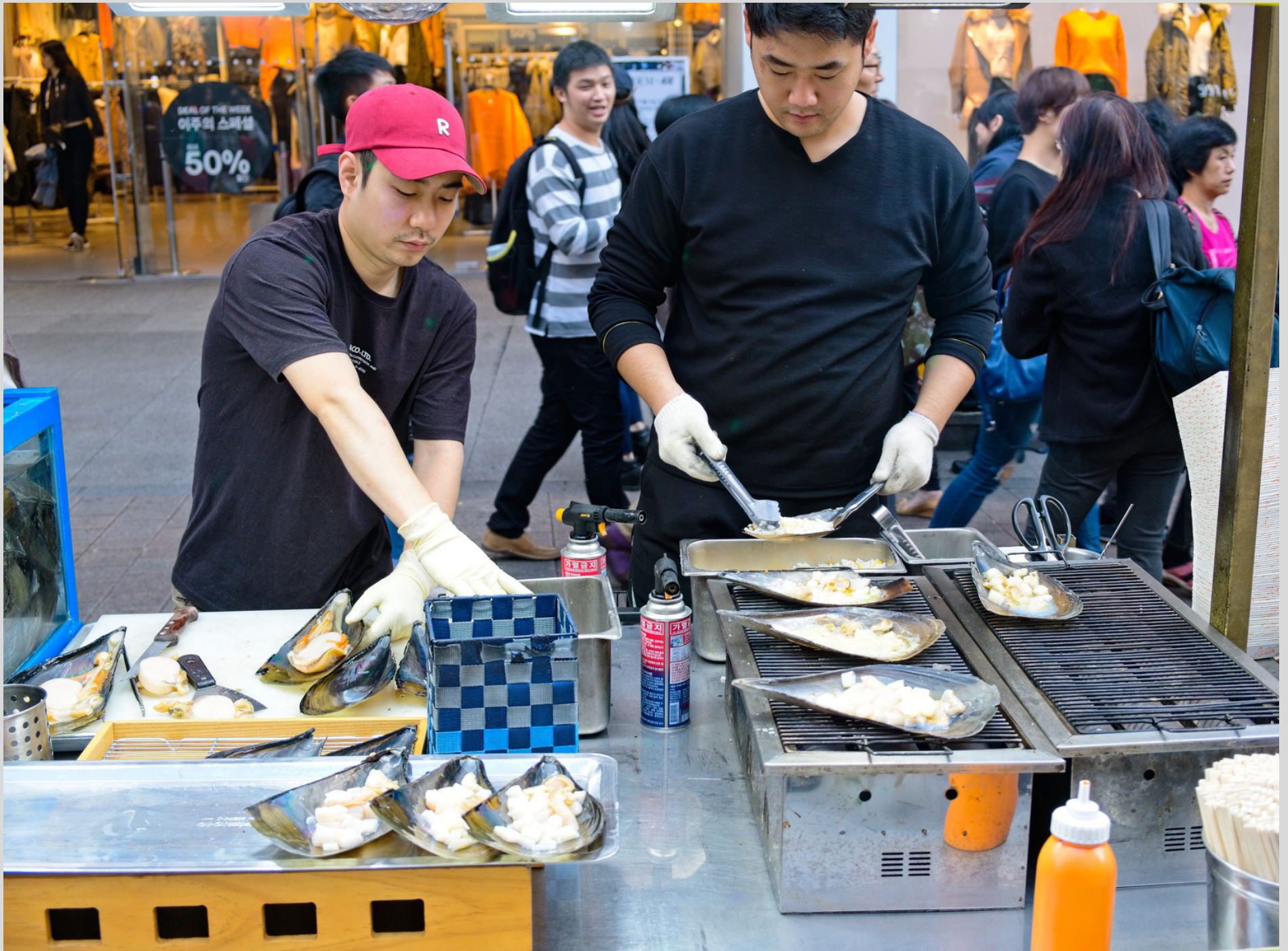
Seoul grilled lobster