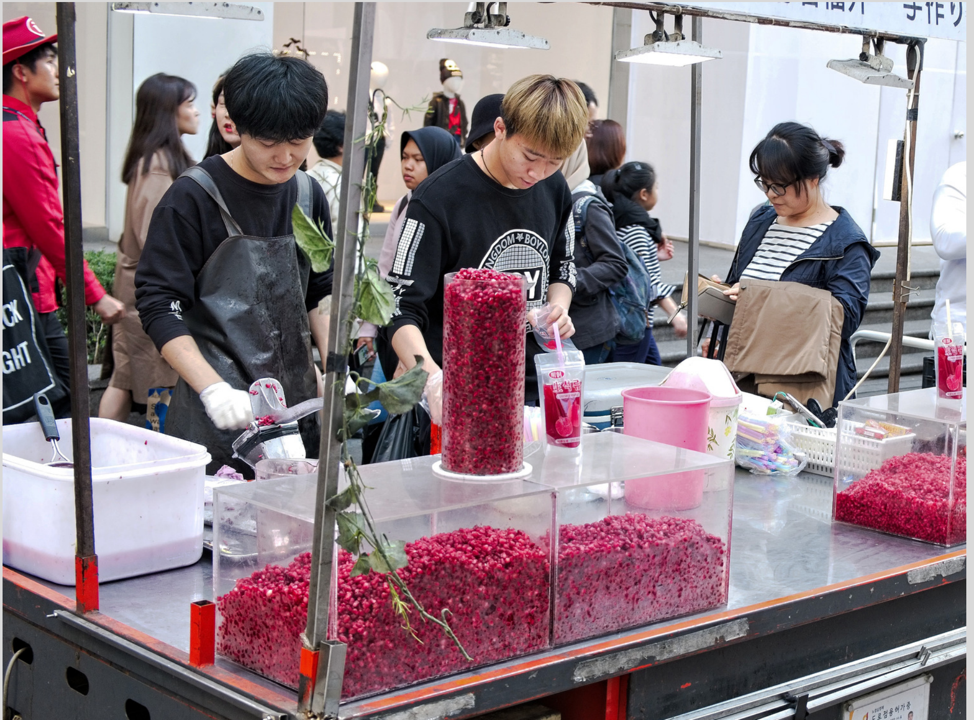
Seoul juice maker