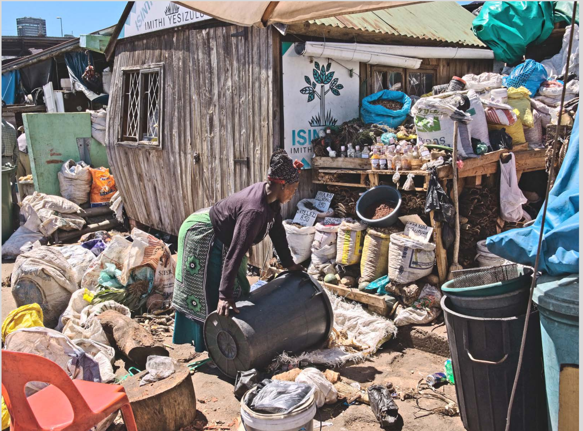
Durban city market