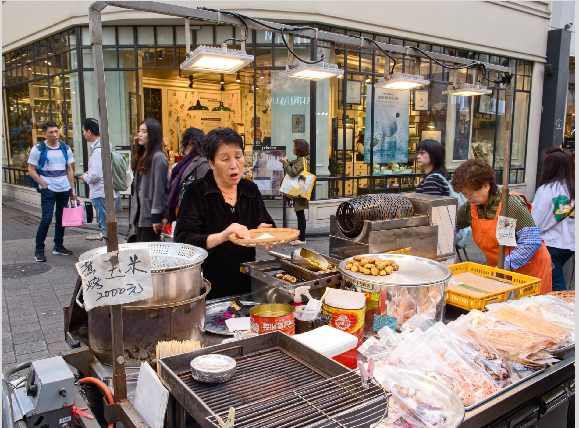
Seoul fried dumplings