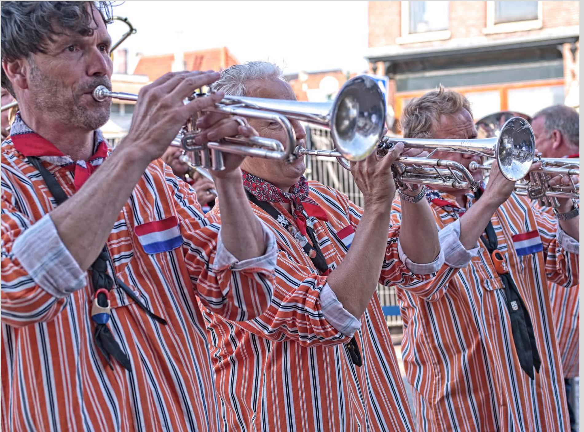
Leiden market brass band