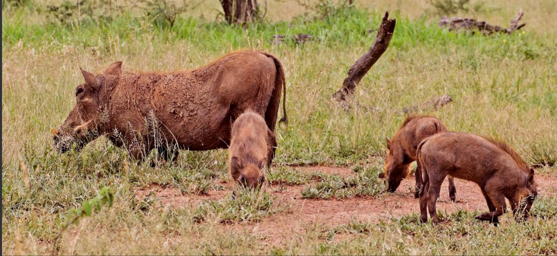
Warthogs and Rhinos